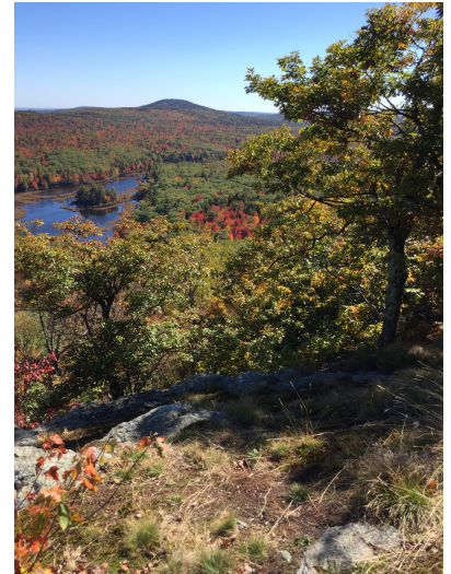
Fall on Wapack Trail