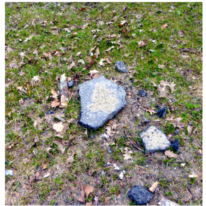
Debris in Monitored Field