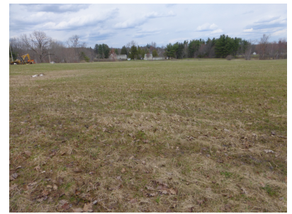
South Road Fields

Both the Morrison Property and the Arnold Property need to have their boundaries marked with signage. If you like hiking in the woods, you may be interested in helping us to monitor our properties. Contact us at Directors@ashbylandtrust.org